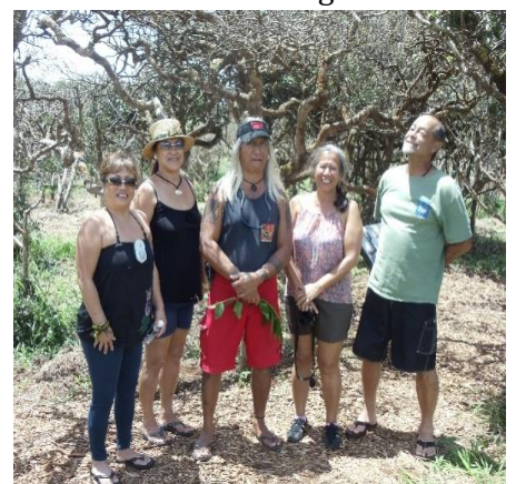
HCCW members on the go to Lana'i Island