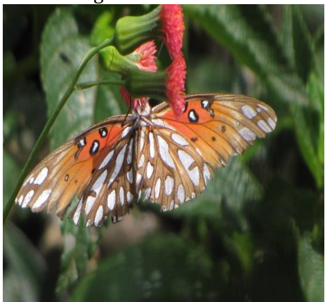
Kamehameha Butterfly