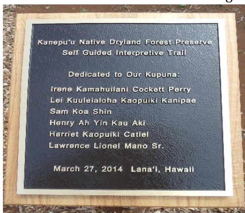
Dedicated to Kupuna o Lana'i